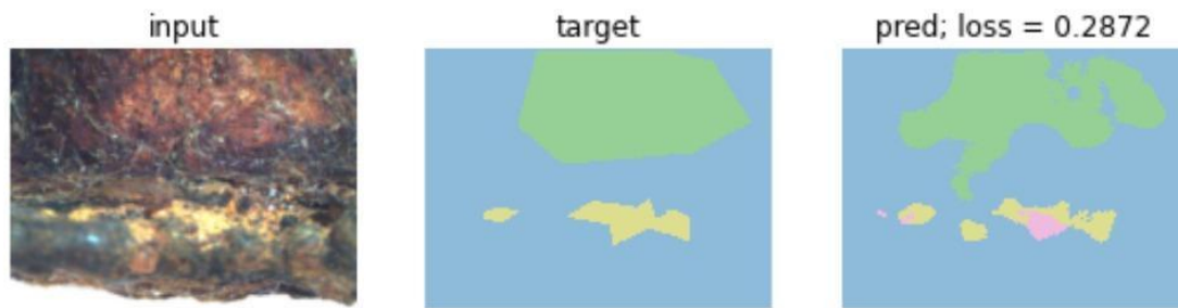
Stereo microscope input of an iron artefact (left), the manual delineation of corrosion compound types by human expert (middle) and segmentation found by deep learning (right)

By using intelligence-endowed algorithms, starting from the data provided by restorers and investigators, it is desired that the obtained results recreate, also for the first time, images and 3D models. The digital reconstruction of objects made by human hands, hundreds or thousands of years ago, which have been subject during all this time to a continuous and intense process of degradation, can be of real use in the process of restoration and implicit conservation of the cultural heritage, by identifying structures, creating images from some abstract information, digitally recreating missing elements from an artefact up to modelling a 3D virtual entity of an object as it would have been in its original state.