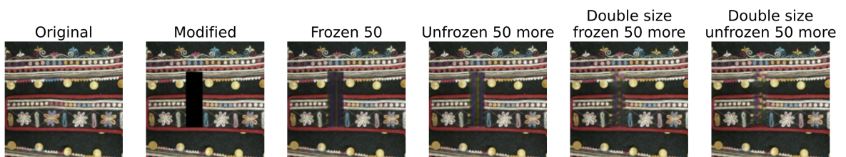
Recreation of a corrupt traditional Romanian vest with deep learning inpainting

By using intelligence-endowed algorithms, starting from the data provided by restorers and investigators, it is desired that the obtained results recreate, also for the first time, images and 3D models. The digital reconstruction of objects made by human hands, hundreds or thousands of years ago, which have been subject during all this time to a continuous and intense process of degradation, can be of real use in the process of restoration and implicit conservation of the cultural heritage, by identifying structures, creating images from some abstract information, digitally recreating missing elements from an artefact up to modelling a 3D virtual entity of an object as it would have been in its original state.